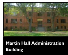
Martin Hall Administration Building

The subsequent years of the College were spent with refinements and enhancements of the educational enterprise. The Articles of Incorporation reflect such efforts with modifications and amendments during periods 1909 to 1966.